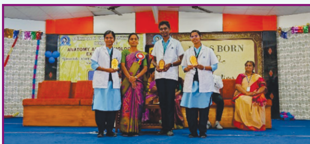
Students of First semester B.Pharm receiving innovation award

B.Pharm first semester students received best innovation award and Pharm D first year students received best craftsmanship award at Anatomy and Physiology exhibition conducted by Nightingale group of institutions, Coimbatore held on Feb 6 th & 7 th , 2025.