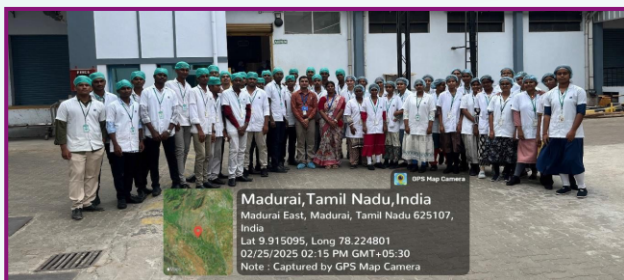
Students Visit Pharmafabrikon, Madurai – Gaining Industrial Insights