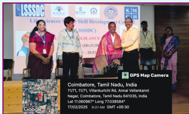
Inauguration of Upskilling and Certification Program under PMKVY 4.0